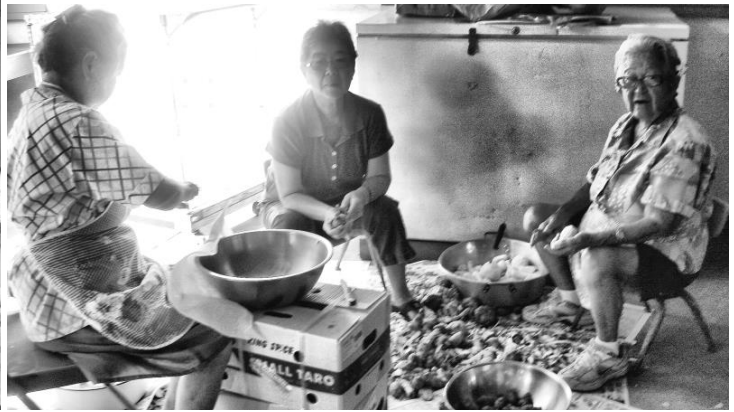
IMO 'ITCHERS' ?