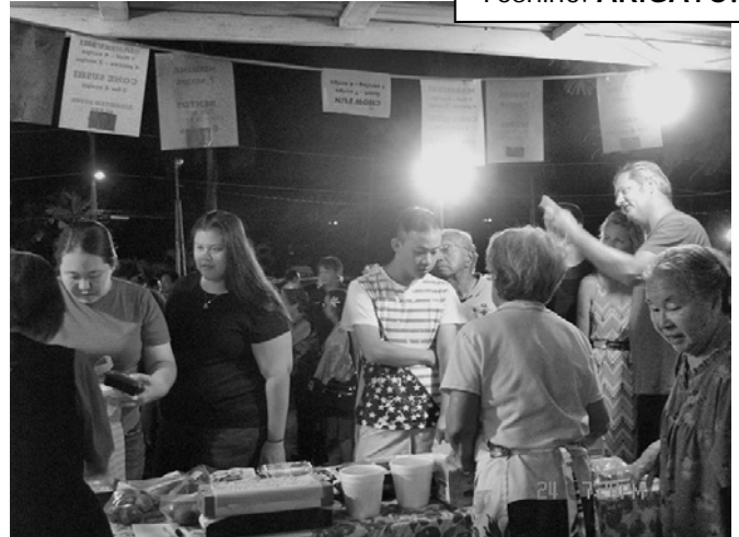
"I'll have two of these and .... What's that?"