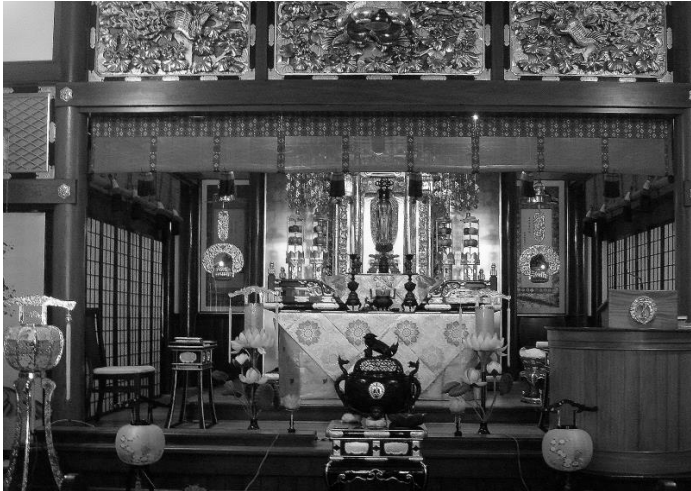
The Hondo, all dressed up, reverently awaits the Hatsubon Service.