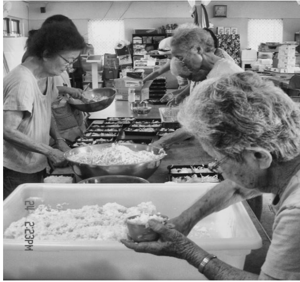
The Bento Packers