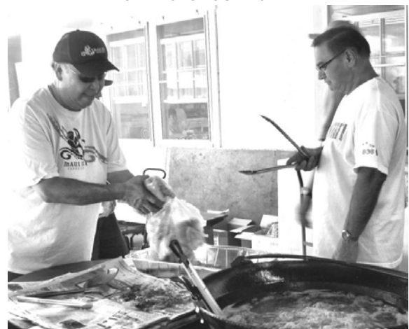
KATSU KREW 2