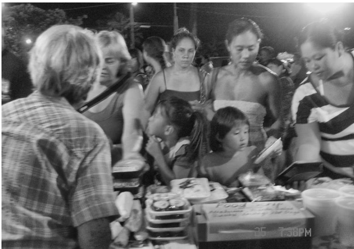
"Oh, no ... You mean the andagi is all gone ?!! "